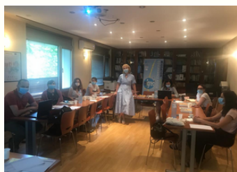
Consultations about the MIGREC's vision, mission and core values