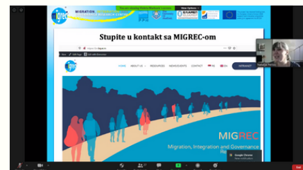
Online discussion „Protection of Migrant Children during the Coronavirus Outbreak“ organized by FPN KonekTas